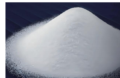
STEP1 Material Compounding