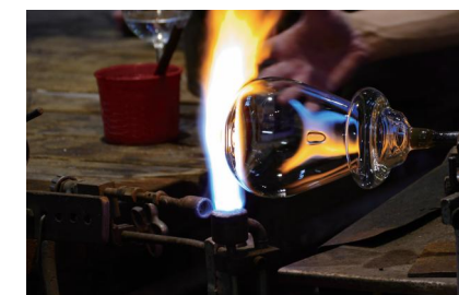
STEP2 Glass processing