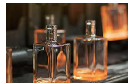
STEP4 Quality Control