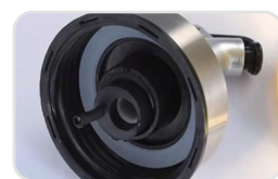
Contained silicone sealing ring